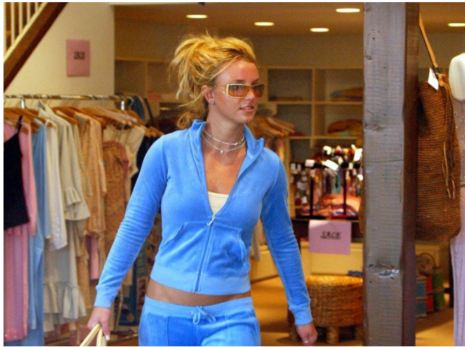
Britney Spears in a blue Juicy Couture Tracksuit

outfit with some accessories and a baguette bag. Velour Tracksuits are also back in trend with Juicy Couture. The tracksuits can be paired with semi-cropped tops, sandals and many other accessories.