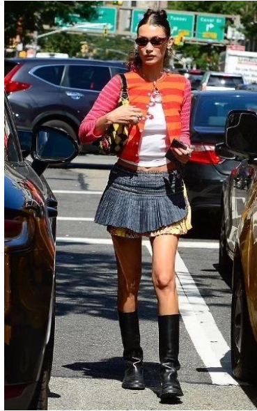
Bella Hadid wearing a mini denim skirt