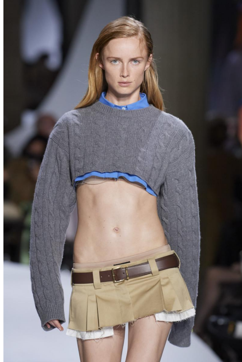
Miu Miu's micro-micro-mini skirt